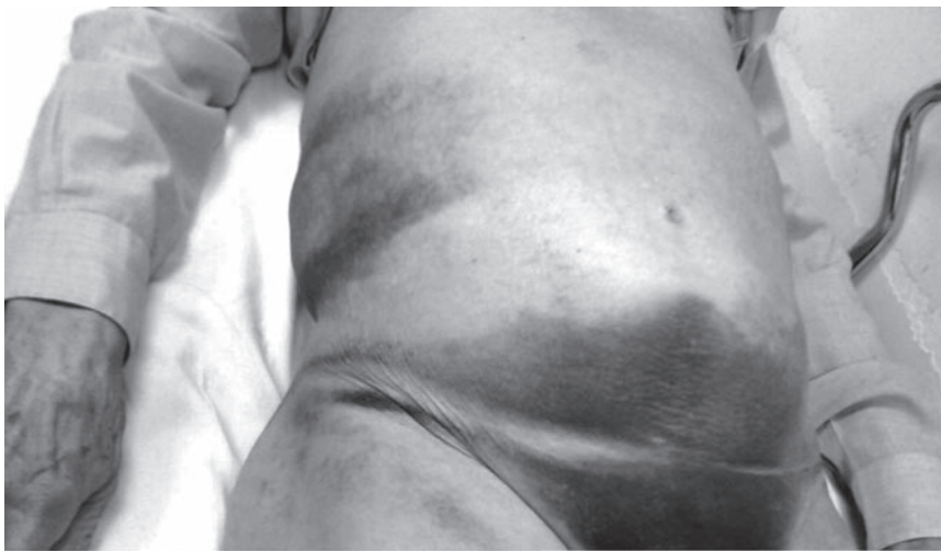
Figure 1. Grey-Turner's sign in right flank and suprapubic ecchymosis.

Grey-Turner's sign, haemorrhagic discoloration over the flank, was first described by the British surgeon Gilbert Grey-Turner in 1919. 1 It is well known for its association with haemorrhagic pancreatitis. It is also described in a wide variety of other disorders that give rise to retroperitoneal haemorrhage such as ruptured abdominal aortic aneurysm, 2 ruptured renal cyst, 3 ruptured hepatocellular carcinoma 4 and cirrhosis. 5 Grey-Turner