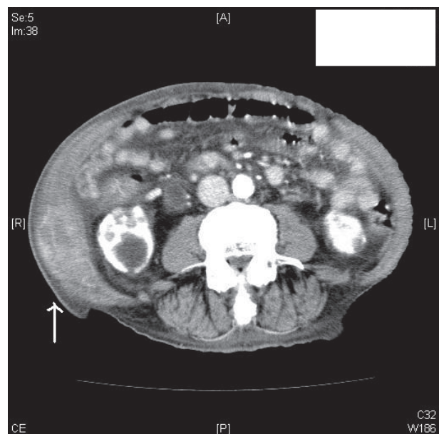
Figure 3. Transverse contrast CT scan of abdomen showing a haematoma in right lateral abdominal wall (arrow).