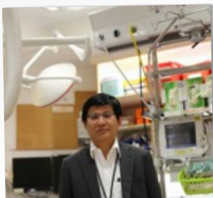
RESUSCITATION ROOM, QUEEN ELIZABETH HOSPITAL

We could see there is potential for the College to grow even further with such an experienced and dedicated team in place. There will be many challenges as well as good opportunities that lay ahead of us. Teamwork and sense of openness would be very important nowadays in managing the College's affairs.