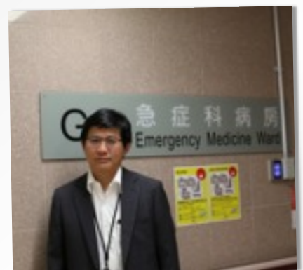
EMERGENCY MEDICINE WARD QUEEN ELIZABETH HOSPITAL